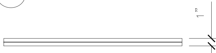
2 PANEL 160 – EDGE