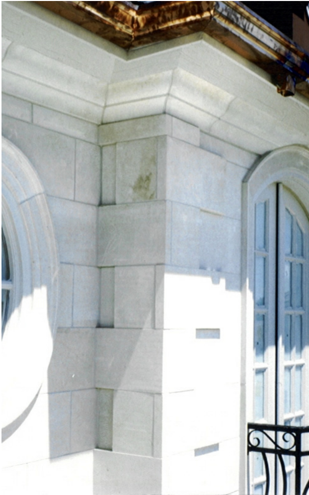
Quoined Corner (See p. 2.1.1 of ALC Solution Manual)