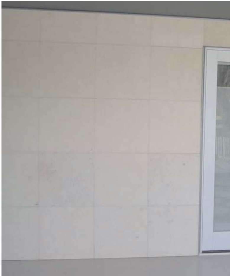
Panel 160 (see p. 2.6.3 of ALC Solution Manual)